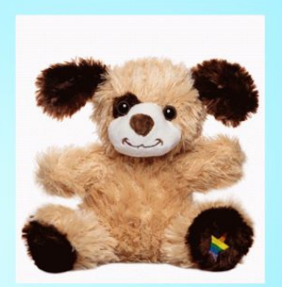
$7 Per Accessory